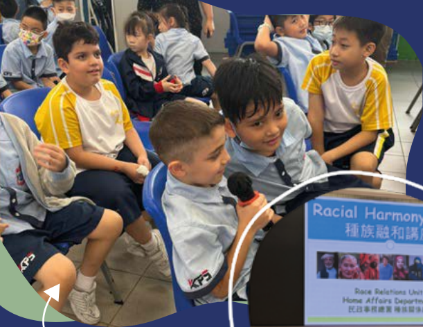
NCS students talking about their culture