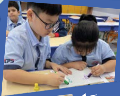
NCS Big Brother teaching writing