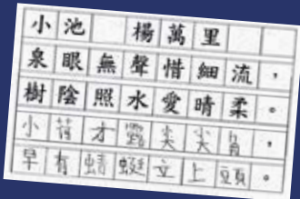
P.3 student work