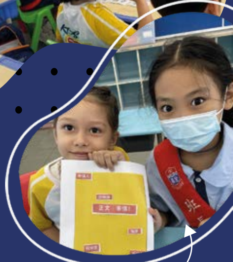
NCS Pull-out Chinese lessons