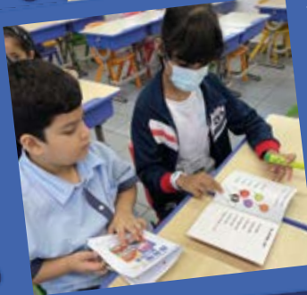
NCS Big Sister telling story