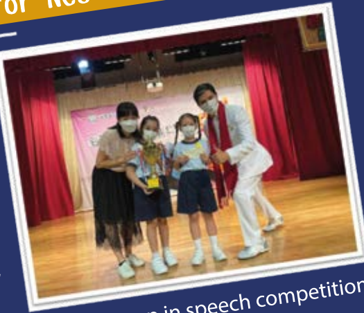
First runner-up in speech competition